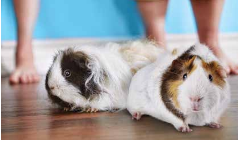
†Less than 6 months old eat only alfalfa hay. More than 6 months old eat only timothy hay and other quality