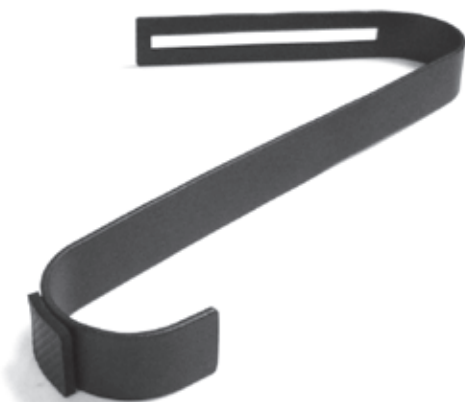
Support Brackets (2)